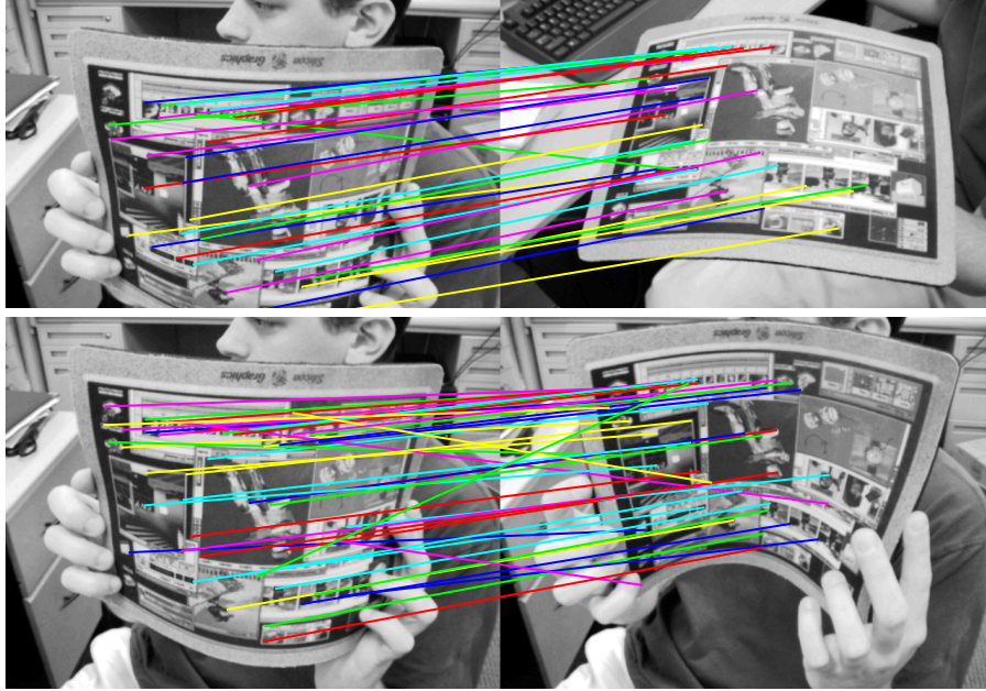
Fig. 1. Affine tracking + KPCA: A non-planar surface undergoing warping and viewpoint changes. (Top-left) The first image of the training sequence. (Top-right) The test image, outside of the training sequence. 27 feature locations were correctly matched, with 2 false positives. (Bottom-left) Image from the training sequence. (Bottom-right) The warped object. 40 locations correctly matched, 6 false positives.