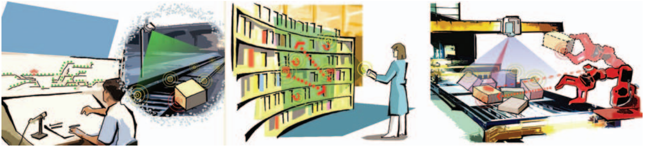
Figure 3. (Left) Detecting an obstruction (such as person on the tracks near a platform, a disabled vehicle at a railroad intersection, or suspicious material on the tracks). Identifying an obstruction with a camera-based system is difficult, owing to the necessary complex image analysis under unknown lighting conditions. RFIG tags can be sprinkled along the tracks and illuminated with a fixed or steered beam of temporally modulated light (not necessarily a projector). Tags respond with the status of the reception of the modulated light. Lack of reception indicates an obstruction; a notice can then be sent to a central monitoring facility where a railroad traffic controller observes the scene, perhaps using a pan-tilt-zoom surveillance camera. (Middle) Books in a library. RF-tagged books make it easy to generate a list of titles within the RF range. However, incomplete location information makes it difficult to determine which books are out of alphabetically sorted order. In addition, inadequate information concerning book orientation makes it difficult to detect whether books are placed upside down. With RFIG and a handheld projector, the librarian can identify book title, as well as the book's physical location and orientation. Based on a mismatch in title sort with respect to the location sort, the system provides instant visual feedback and instructions (shown here as red arrows for original positions). (Right) Laser-guided robot. Guiding a robot to pick a certain object in a pile of objects on a moving conveyor belt, the projector locates the RFIG-tagged object, illuminating it with an easily identifiable temporal pattern. A camera attached to the robot arm locks onto this pattern, enabling the robot to home in on the object.

intruders in home-security alarm systems. But wireless tag-based systems are ideally suited for applications where running wires to both ends is impractical. Using retro-reflective markers and detecting a return beam is another common strategy for avoiding wires, but sprinkling a large number of markers creates an authoring nightmare in terms of creating a large index table. In the case of RFIG, tag IDs and locations, along with the status of reception of the modulated light, are easy to report. Lack of reception indicates some kind of obstruction, which can be relayed to a central facility where a human observer monitors the scene, possibly through a pan-tilt-zoom surveillance camera.