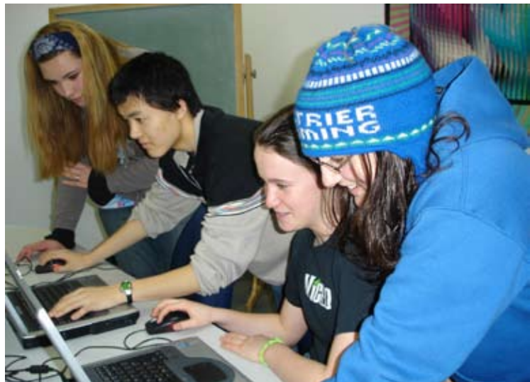
Wilmette Public Library game designers work out a coding problem.

Over the course of five to six weekly sessions, WPL's Game Maker Academy provides design projects that combine multiple levels of play and media platforms, introducing various classic game genres by leading the student through the creation of examples such as Pong, Asteroids, Tetris, and platform or role-playing games based on Super Mario and Sonic. Instruction is organized in a scaffolded structure, challenging students to invest techniques and experience acquired while working on earlier projects. In