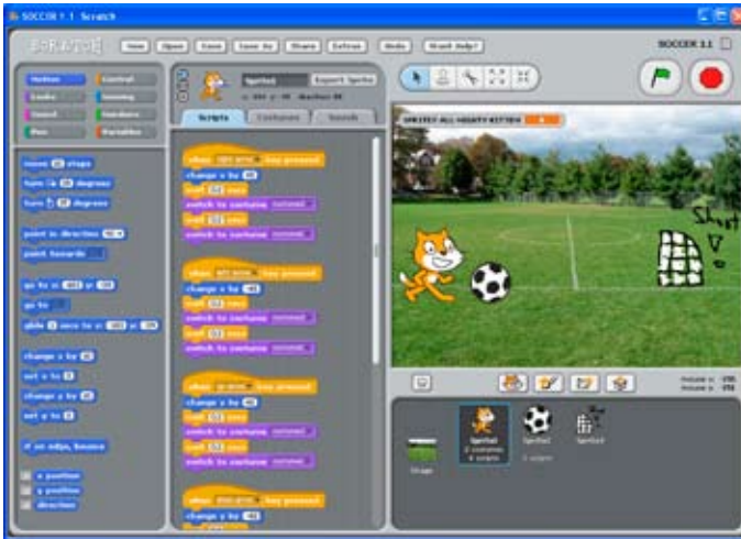
Details of the Scratch coding panel with stackable coding blocks (top) and the Game Maker editing screen.

the process, students gain an understanding of mathematical concepts necessary to coordinate animated objects, and of programming concepts necessary to trigger events. They also gain basic competencies in the use of graphic and sound-editing tools such as Photoshop, GIMP, Audacity, and Anvil Studio. Over the course of the program, students combine storytelling, digital graphic and audio editing, logic, and mathematics while participating in a process that is both richly engaging and personally rewarding.