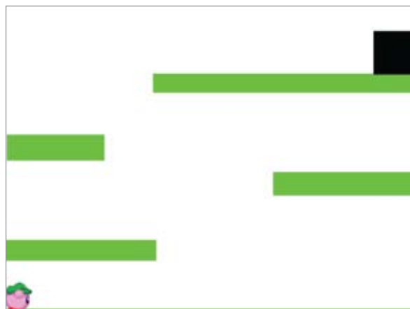
An example of a student-created game using the Scratch programming tool.

We decided to offer game design classes with several goals in mind: to develop fun and innovative teen-oriented programs, to broaden our existing gaming programs, to support teens’ use of new participatory technologies, and to promote 21st-century literacies by embedding learning activities within a highly motivating context. By facilitating active participation in the design process itself, we hoped to give young people the opportunity to develop skills and knowledge at a much deeper level than if they were merely to attend a class or demonstration. And by situating learning activities within a purposeful context,