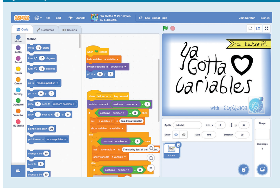
Figure 4. Taryn's tutorial on how to use variables.

Figure 3. Taryn's Scratch project modeling the water cycle. C C X N O 😂 Code 🛛 🖋 Costumes The Water Cycle! Looks move 10 steps Sound Events Contro Sensin • Usrishis O Rioc 1 у 90 0 = to 115