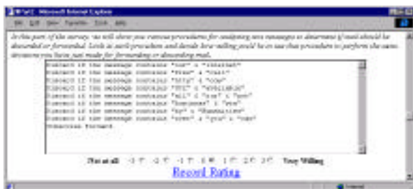
Figure 6. Subjects provide feedback on mail profiles.

The average rating of subjects for each type of mail profile is shown in Table 1. We performed a paired one-tailed t-test to determine which of the eight hypotheses discussed in Section 2 were supported by the experimental findings. We used a Bonferroni adjustment to account for the fact that we are making 8 comparisons.