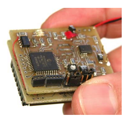
Figure 1: Conversation Finder node prototype

In order to determine who is part of the user's conversation, we have developed short-range radio sensor nodes (38x33x15mm) with dual microprocessors and microphone (Figure 1), worn close to the neck. They observe the wearers' conversational turn taking. Basu [1] has showed that alignment of speech is a reliable indicator for conversational groupings. Our approach is novel, however, because the groupings are detected in real-time, and each sensor node is autonomous and comes to a conclusion independently.