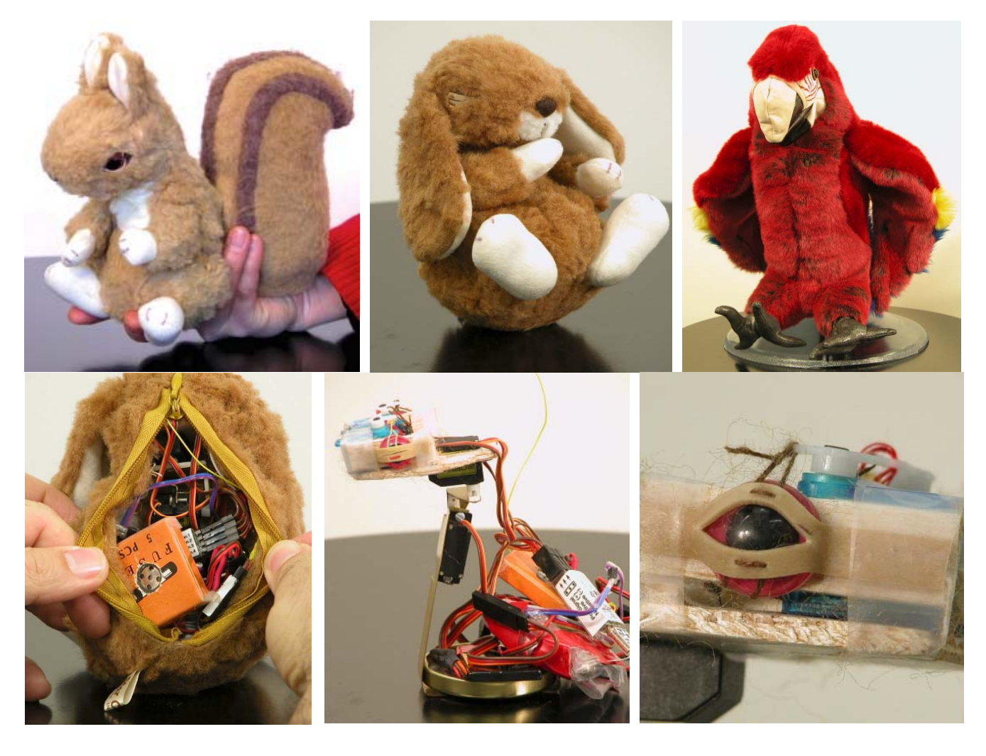
Figure 1: Top row, left to right: squirrel (11cm tall), bunny (10cm tall); parrot (38cm tall). Bottom row: bunny with open back, bunny skeleton, eye and lid mechanics.

We use zoomorphic embodiments combined with anthropomorphic behaviors (gaze, gestures). Although this combination partially violates the 'life-likeness' of our crea-