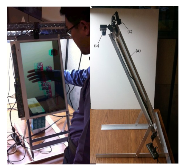
Figure 2. User is interacting with virtual content by reaching behind display.

Figure 3. System side view: (a) transparent LCD panel; (b) depth camera; (c) Webcam.