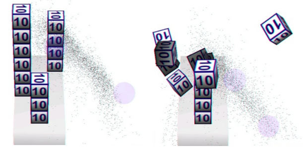
Figure 6. Point cloud and 3D dices, before (left) and after (right) collision with hand; the point cloud bounding box is rendered transparently.

The first prototype demonstrated the feasibility of our reachingbehind approach, but confines the interaction to mostly 2D space. Therefore, we utilize a depth camera [15] (Figure 5) in our second implementation. Because the camera is facing away from the user and sees only his hand, we don't need to detect body parts as in [14]. Moreover, in the case of a static display, to avoid a recognition step, we assume a static background and filter it out in a method similar to z-buffer. After a data frame is filtered based on amplitude (discard pixels with weak signal) and "background-ness", the remaining pixels form a point cloud, and statistical filtering is applied to eliminate isolated outliers [16]. The resulting points are clustered based on distance, and only the largest cluster is kept. We approximate the cluster via an oriented box whose orientation and size is calculated using Principal Component Analysis. Finally, to enable collision based interaction methods, we add two spheres on the opposite sides of the box. Figure 6 shows the point cloud generated by the hand, as well as virtual objects (stack of dices, in Ogre3D) before and after a collision with the hand.