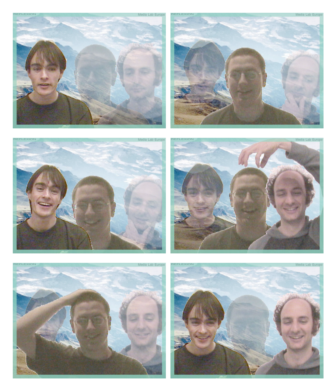
Figure 1: Screen shots from a three-person Reflexion session.

Reflexion expands on the work of an early prototype from our organization known as Reflection of Presence [1]. Some references to other key related work include: an early system for "voice voting" to determine camera views in a video conference [2], the Clearboard system for shared drawing spaces [3], and the HyperMirror system which has experimented with blue screen technology to layer one participant into a scene consisting of another [4].