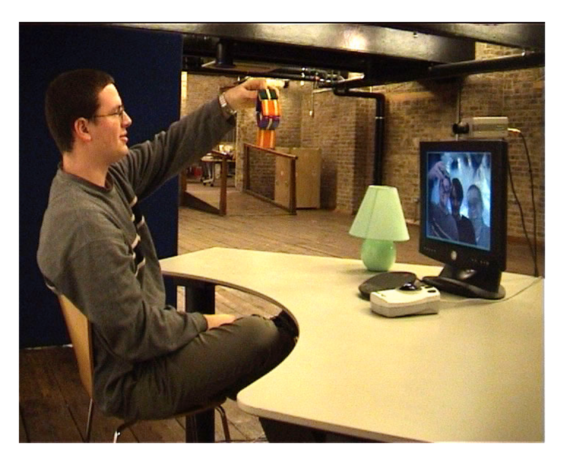
Figure 2: Scene of a Reflexion station at our lab, illustrating the mirror effect of the display.