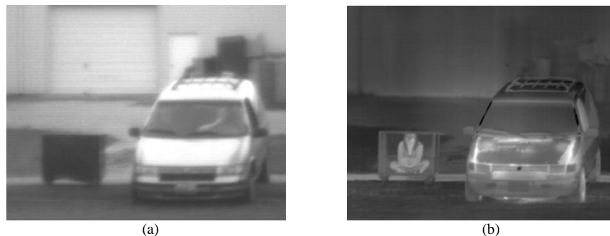
Figure 3. Sample images acquired in the (a) visible and (b) LWIR spectral bands using the coaxial dual-band system shown in Fig. 2-b. The visible image has been cropped to match the field of view of the LWIR image.