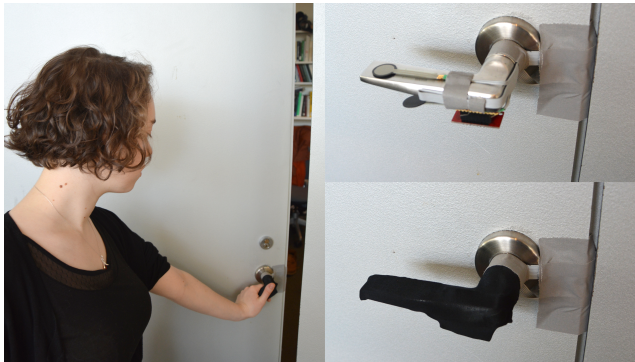
Figure 2: A person interacting with Dooremi and details of the handle one stripped with and without protective cover

We used a bend sensor placed on the hinge to detect the rotation angle of the door, pressure sensors to detect some parameters of the way the user grabs the handle, and an inertial measurement unit (IMU) on the handle to measure the rotation of the handle. A future version will be entirely embedded in the knob and will also contain a capacitive sensing system to detect first touch and more precision on the user's grip. The signals are read with arduino which communicates with Max MSP via OSC. For mode 3, Max sends data to a SuperCollider patch that generates different layers of ambient sound by granular synthesis. Max or SuperCollider then output the sound signal which is amplified and sent to a transducer directly attached on the back of the door. In doing so, the door is also used as a "speaker" which makes the system more embedded. In addition, the resonance and vibratory feeling on the door reproduce more closely the sensation of regular door cracking.