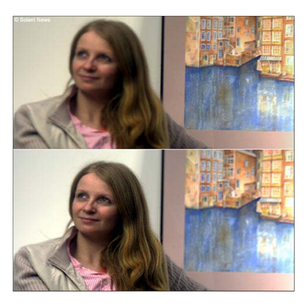
Before and after: The new system allows the user to focus after the photo has been taken

The innovation took two years to develop by scientists at Mitsubishi Electric Research Labs, who call it a "heterodyne light field camera".