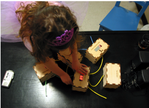
Figure 1: A four-year-old girl plays with the System Blocks

We present the System Blocks, a new physical interactive system that makes it easier for kids to explore dynamic systems. A set of computationally enhanced children blocks, made of wood and electronics, the System Blocks can assist K-12 educators to teach the complex concepts of system dynamics and causalities. System dynamics and system thinking are methods for studying the world around us. They deal with understanding how complex systems change over time, and how structure influences behavior. In this paper we will show how the System Blocks enable young children (as early as four years old) to create and interact with systems that simulate real-life dynamic behavior such as a bank account; population growth; or the delicate equilibrium of an ecosystem. The System Blocks gives young children a hands-on environment to learn about complex behavior and encourage new ways of thinking.