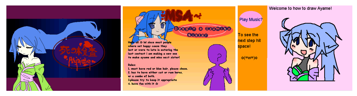
Figure 1: Screen shots from BalaBethany's anime series, contest, and tutorial

Over the course of a year, BalaBethany programmed and shared more than 200 Scratch projects, covering a wide range of different types of projects (stories, contests, tutorials, and others). Her programming and artistic skills progressed over time, and her projects clearly resonated with the Scratch community, receiving more than 12,000 comments.