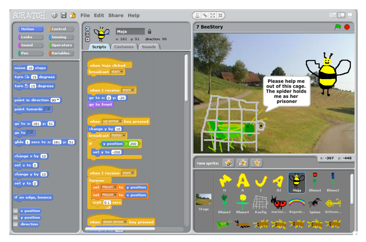
Figure 3: Scratch User Interface

Scratch is designed to be highly interactive. Just on a stack of blocks and it starts to run immediately. You can even make changes to a stack as it is running, so it is easy to experiment with new ideas incrementally and iteratively. Want to create parallel threads? Simply create multiple stacks of blocks. Our goal is to make parallel execution as intuitive as sequential execution.