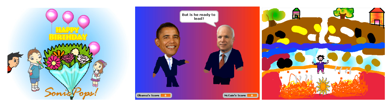
Figure 4: Screen shots from sample Scratch projects

We continue to be amazed by the diversity of projects that appear on the Scratch website. As expected, there are lots of games on the site, ranging from painstakingly recreated versions of favorite video games (such as Donkey Kong) to totally original games. But there are many other genres too. Some Scratch projects document life experiences, such as a family vacation in Florida, while others document imaginary wished-for experiences, such as a trip to meet other Scratchers. Some Scratch projects, such as birthday cards and messages of appreciation, are intended to cultivate relationships. Others are designed to raise awareness on social issues such as global warming or animal abuse. During the 2008 U.S. Presidential election, there was a flurry of projects featuring Barack Obama and John McCain – and then a series of projects by Scratchers self-organizing an election for the not-quite-defined position of "President of Scratch."