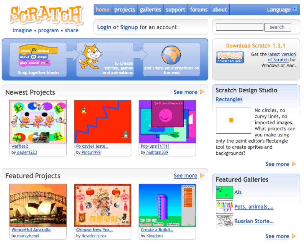
Figure 6: Scratch website

browser (using a Java-based player), comment on the project, vote for the project (by clicking the "Love it?" button), or download the project to view and revise the scripts. (All projects shared on the website are covered by Creative Commons license.)