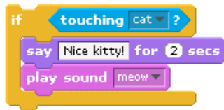
Figure 1: Programming in Scratch

Creating computer programs in the current version of Scratch is much easier than in traditional programming languages: children can simply snap together graphical blocks, much like LEGO bricks or puzzle pieces. But there are still significant challenges. Programming in Scratch still requires reading and writing, and the number and complexity of the programming blocks can be overwhelming for young children. Figure 1 shows a screenshot of the way in which current programs are created in Scratch. Figure 2 shows the Scratch user interface, which includes a large number of features and icons.