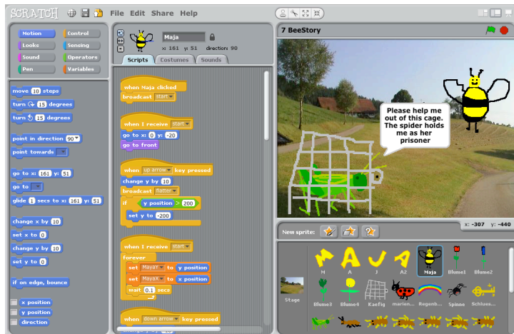
Figure 2: Scratch user interface