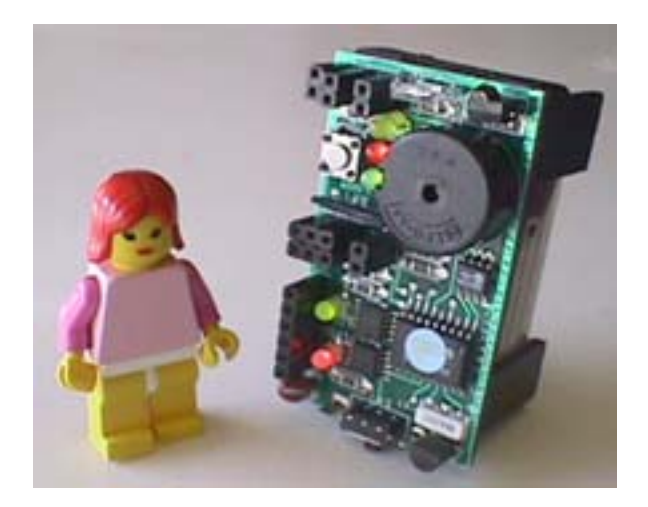
Figure 1: Cricket (with LEGO figure shown for scale)

Most important, the Crickets are fully programmable: students can write and download computer programs into the Crickets from a desktop computer. We have extended our previous development of Logo-based programming environments, with a goal of making it even easier for students to write (and understand) control- and sensing-oriented computer programs. At the same time, we have made these programming tools compatible with graphing and analysis software "components," so that students can easily investigate trends and patterns in the data that they collect with their Crickets.