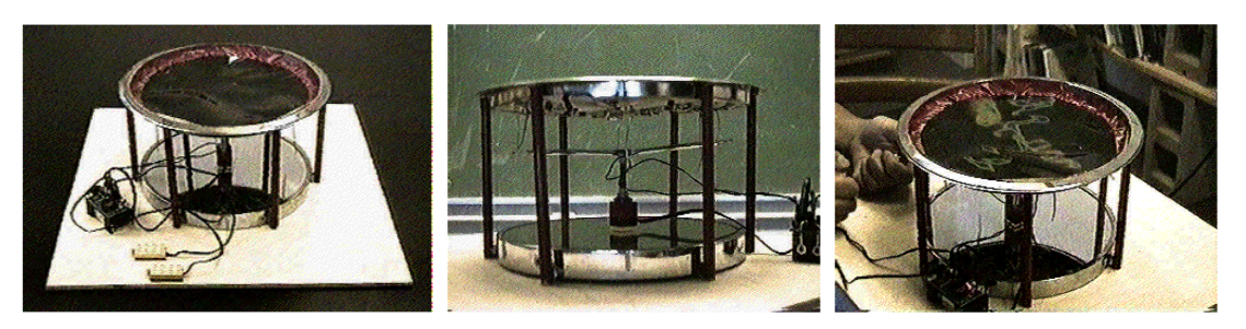
Figure 6: The current display device

These two devices reflect the wide range of materials that have become available for the purposes of home scientific crafts – materials ranging from portable computers (the Crickets themselves), sensors, and innovative materials to plastic toy pieces and "low tech" wooden blocks. The light meter made use of a wooden frame, metal piping, and foam-core "petals" (in addition to the Cricket and LEGO pieces); the current display device made use of a novel material (the temperature-sensitive film) that is available from science-education catalogs at a moderate cost. Where, for a previous generation, "home science" would often imply a relatively narrow range of simple working materials, the combination of Crickets and a burgeoning world of new materials has opened new possibilities for informal scientific creation (Eisenberg and Eisenberg, 1998).