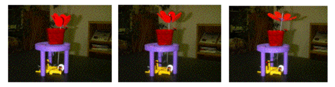
Figure 5: The "flower" light meter