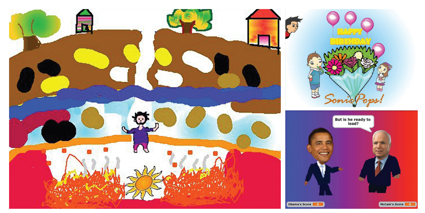
Figure 4. Screenshots from sample Scratch projects.

rapid prototyping and iterative design. Before we launched Scratch in 2007, we continually field-tested prototypes in real-world settings, revising over and over based on feedback and suggestions from the field.<sup>4</sup>