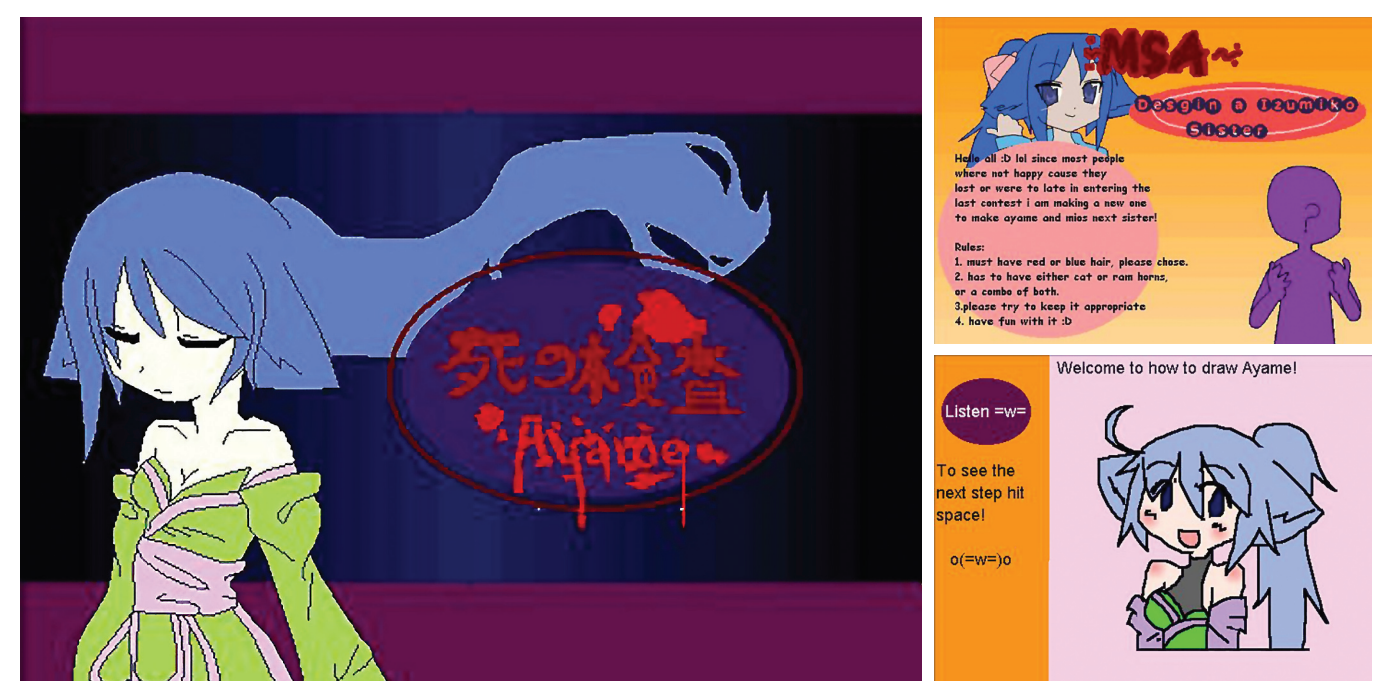
Figure 1. Screenshots from BalaBethany's anime series, contest, and tutorial.

She periodically added new characters to her series and at one point asked why not involve the whole Scratch community in the process? She created and uploaded a new Scratch project that announced a "contest," asking other community members to design a sister for one of her characters (see Figure 1). The project listed a set of requirements for the new character, including "Must have red or blue hair, please choose" and "Has to have either cat or ram horns, or a combo of both."