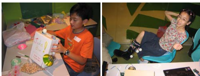
Figure 2: Projects from a Cricket workshop

As we develop new technologies for children, our hope is that children will continually surprise themselves (and surprise us too) as they explore the space of possibilities. When we created Crickets, we didn't imagine that children would use them to measure their speed on rollerblades, or to create a machine for polishing and buffing their fingernails. To support and encourage this diversity, we explicitly include elements and features that can be used in many different ways. The design challenge is to develop features specific enough so that children can quickly learn how to use them, but general enough so that children can continue to imagine new ways to use them [14].