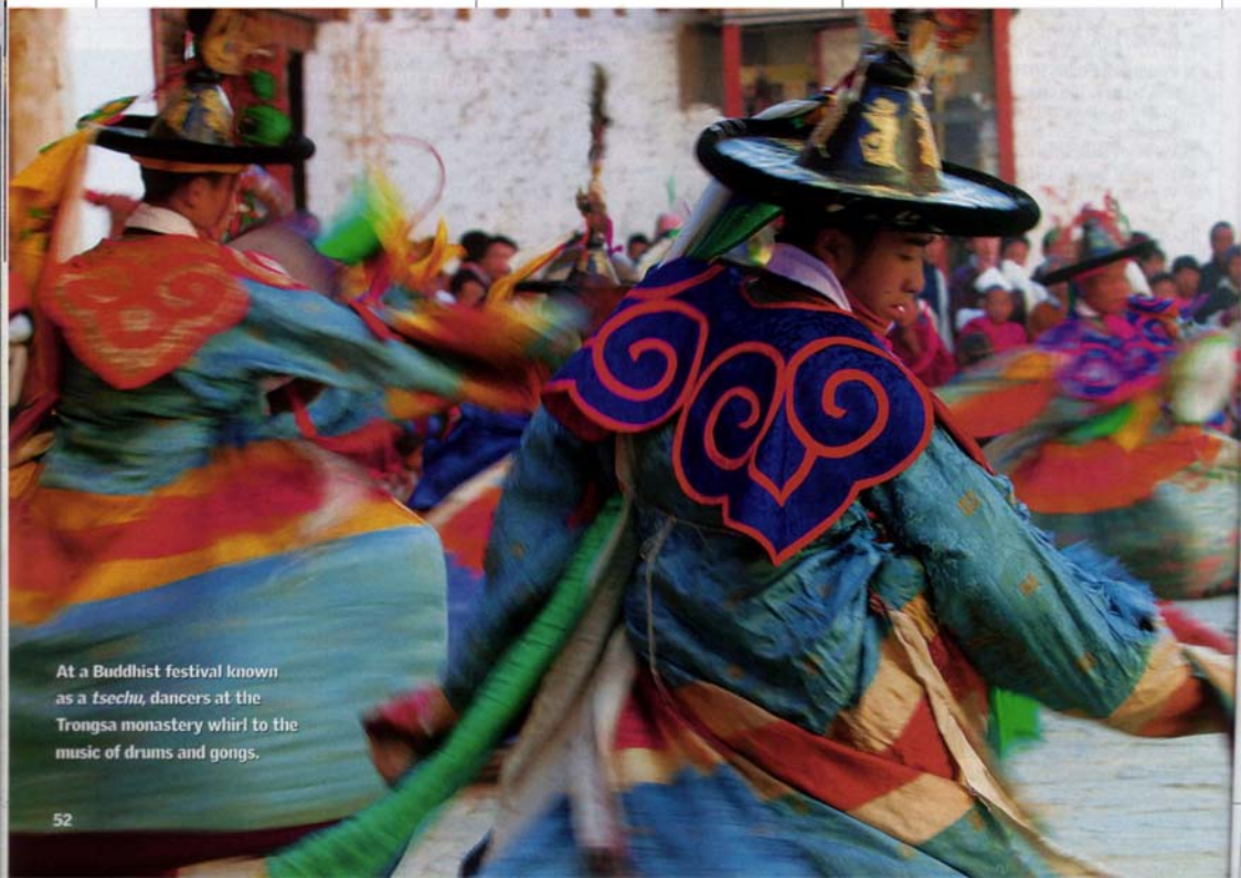
At a Buddhist festival known as a tsechu , dancers at the Trongsa monastery whirl to the music of drums and gongs.