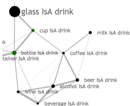
Figure 3. An assertion network showing that “Cup IsA Drink” was inferred from a bogus assertion in the KB, “Glass IsA Drink”.

There are three interactive controls over the visualization, shown in Figure 2. First, dimensionality , which controls how “liberal” or “conservative” the inference is. For concepts, liberal inference results in more similarity links; for assertions, more inferences. Spacing supplies “negative gravity” making semantic clusters more readable. The link