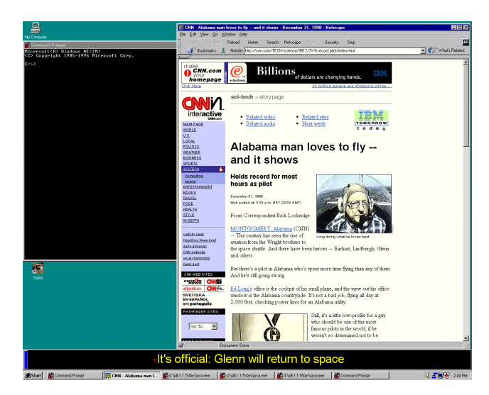
Figure 1: Sample screen showing scrolling display.

In one mode, Suitor delivers information to its user through a scrolling one-line text display located at the bottom of the screen (see Figure 1) — a peripheral display. Suitor can also deliver information through a web browser, by email, or to a personal