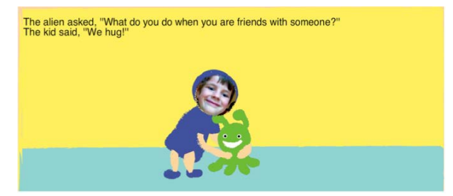
Figure 2: "Expressions with an Alien" story is played in the Story World with a child's recorded face.

StoryFaces currently includes three pre-made stories designed to involve a variety of emotional expressions. For example, "Expressions with an Alien" involves a curious friendly alien asking a child about human facial expressions (Figure 2). "In the Balloon" is a story that involves two children going on an adventure in the hot air balloon (Figure 3). "Walking in the Woods" is an adaptation of the classic fairy tale "Little Red Riding Hood" with the twist that the child unwittingly acts out the expressions both for the little girl and for the trickster Wolf. Details of these stories are discussed in [[23]].