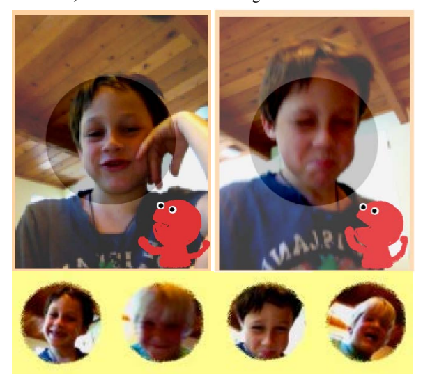
Figure 1: A child recording expressions in the Video Booth. Recorded expressions are shown as thumbnails at the bottom of the video booth. When clicked, the thumbnails play the video preview.

StoryFaces is a multimodal tool for children's expressions that combines acting, performative play with story boarding, story drawing, and story composition. StoryFaces invites children to capture their own facial expressions in a virtual video booth (Figure 1) and create animated stories with their recorded videos and audio, as well as their own drawings.