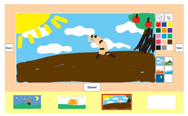
Figure 5: Children can draw their own story backgrounds. The original backgrounds can be inserted into any of the story