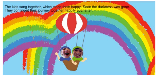
Figure 3: "In the Balloon" story is played in the Story World with two children's recorded faces.