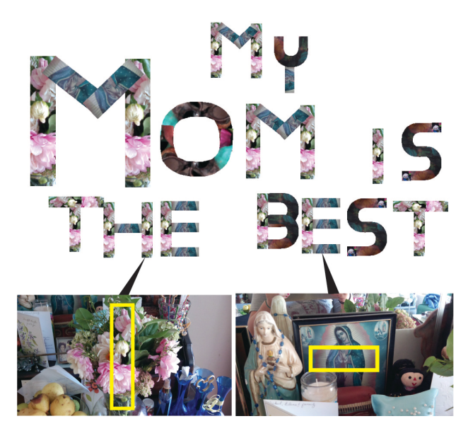
Figure 6: Monica made this composition for her mother using all of her mother's favorite things.