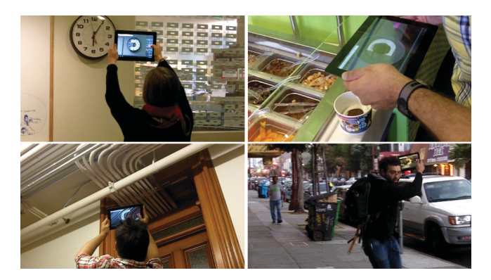
Figure 4: Study participants capturing "c" shapes from clocks, frozen yogurt, pipes, and video of movement while running down the street.

Participants imagined a number of ways they would use AnyType for communication. Using AnyType while traveling seemed like an exciting possibility for many