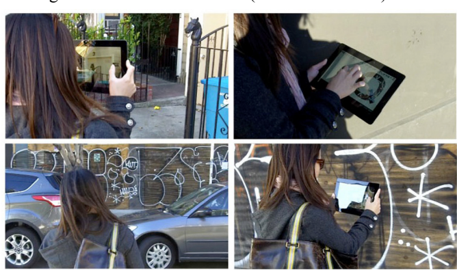
Figure 1: A user peruses their environment capturing shapes. AnyType generates typefaces from those shapes and the user then creates a composition using her personal typeface.

We look to the art of typography as a way to add aesthetic and expressive quality to texts. For centuries, typographers and graphic designers have studied the way in which letterforms and texts work in tandem to evoke a range of expressions. We reconsider our relationship to the current ways of mobile messaging (e.g., via email, phone, texting, etc.) by designing and studying AnyType , a mobile application that offers an alternative approach by composing messages with the elements (visual attributes) of the