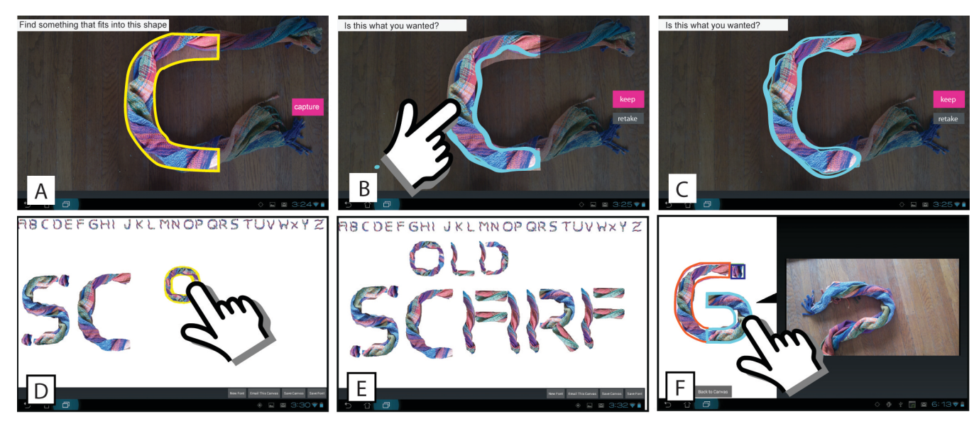
Figure 2: A) The user looks onto her environment through a shaped frame and captures (photographs) an object in this shaped frame. B&C) After capturing the shape, the user can edit by drawing a custom outline for the shape. D&E) After capturing all five shapes, the user is presented with her personal alphabet in the composition mode. The letters can be dragged, scaled and erased with fingers. F) In the history view, the user can see the original photographs that were used to compose each letterform.

When the user or recipient presses and holds one of her finished letters on the canvas, she is taken to the "history view" that shows how the different shapes were arranged to compose that letter. Clicking on one of the letter's shapes reveals the original photo or video from the point of capture. This view is designed so that the user or recipient of the composition can access a history of how each letter was made. For instance, the user may capture a gear from a bicycle in one of the arched shapes. Without added context of the entire image of the bicycle, someone other than the creator viewing the typeface might not be able to discern