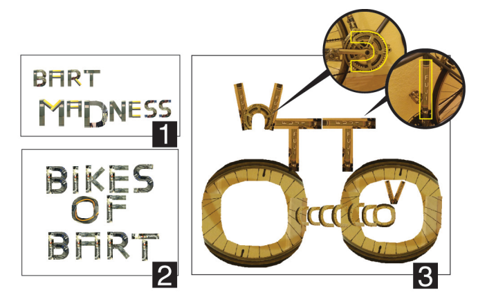
Figure 5: 1) A typeface and composition Karen made on her commute home. 2) Delight with the first composition led her to create the second typeface from the bikes of other commuters. 3) Inspired by her bike typeface from her commute, Karen created another composition of her own bike when she reached home.

As the participants brought AnyType with them on their daily journeys, they found themselves exploring the