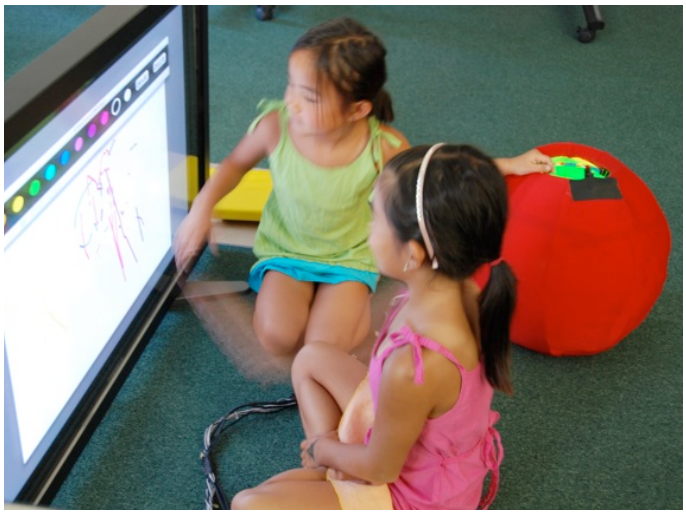
Fig 1. Children create video messages and interactive drawings.