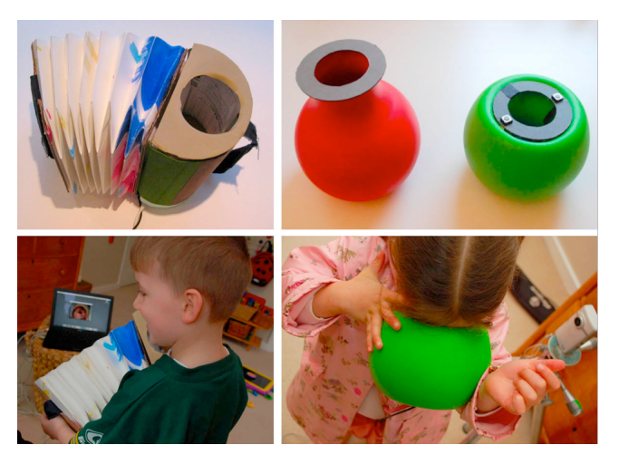
Figure 4. Our earlier vessels: "Accordion" and "Bubbles."

Our evaluation of the initial prototypes with children ages 4-8 revealed that the different vessel shapes, the accordion-like container with bellows and the simple balloon-like round container, elicited different focus and interactions from the children. The bubble, with its simpler shape and its mechanical flexibility, seemed to work better especially for young children. Therefore, we decided to simplify and focus on the bubble as the container shape. The change in pitch during playback mode also seemed difficult for the children to work with, so we decided to focus on modulating only the speed during playback, without affecting the pitch of the original recording.