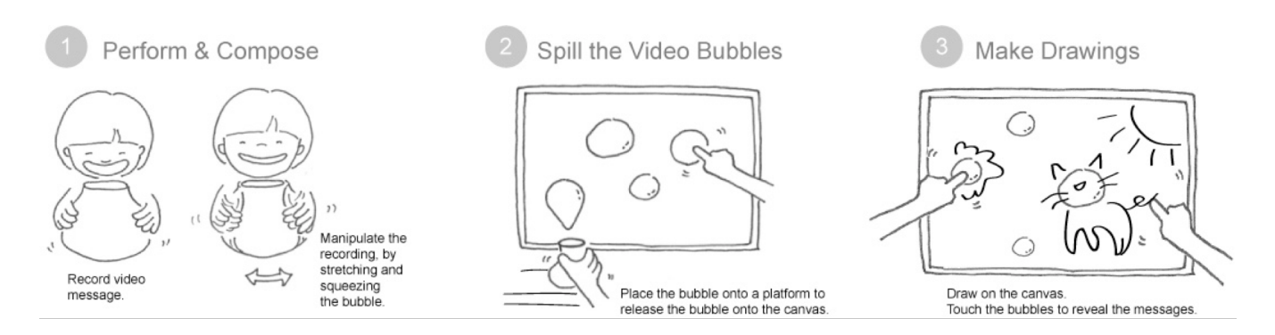
Figure 3. Tangible Bubble interaction flow.

Squeezing at different speeds creates a slow or fast playback of the video without affecting the audibility of the recording. So the child may play back the recorded "Mary!" message at different speed rates. While in playback mode, the screen inside the bubble visually shows what is being played so that children can check the expression. In this way the tangible video bubble is a physical vessel that acts as both a container to hold the message, as well as an instrument to perform and modify their recorded message to create different expressions.