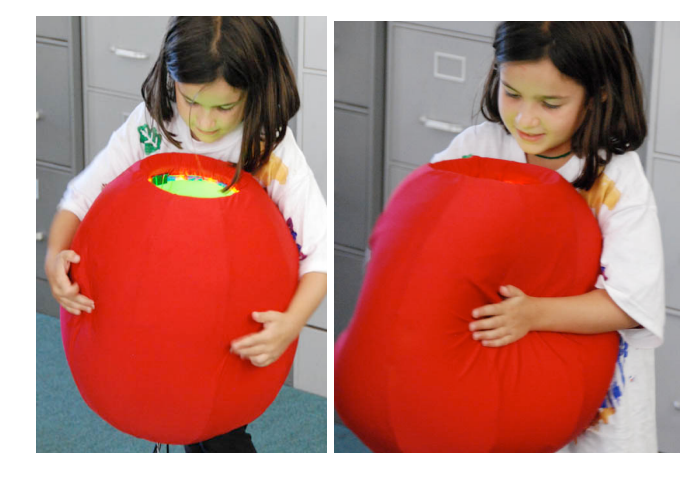
Figure 2. A child recording and playing with the bubble.

The tangible video bubble is a large, soft, and huggable ball equipped with a video camera and a screen for children to record and playback video messages (Figure 2). To record a message, the child presses a button on