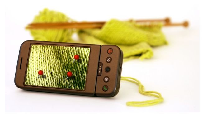
Figure 1. The current Spyn system runs on Android 1.5 G1 phones; vision recognition correlates recorded media with locations on fabric.

Copyright 2010 ACM 978-1-60558-929-9/10/04....$10.00.