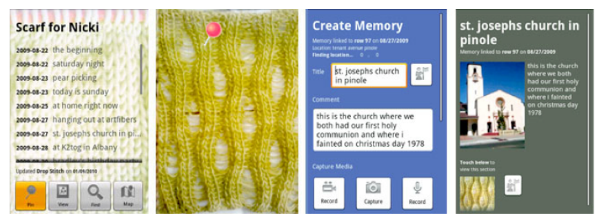
Figure 3. Screenshots of Kyla's Spyn project (left to right) (a) Spyn home screen, (b) pinning garment, (c) creating a new Spyn memory , and (d) viewing the Spyn memory .

our current study involves both the creator and recipient of a craft object, further investigating the creator-recipient relationship over two-to-four weeks. Specifically, we study the following questions: