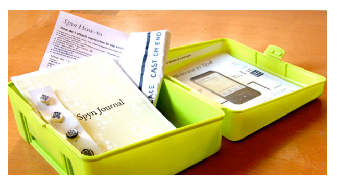
Figure 5. The Spyn "Kit". The kit contained support materials for the Spyn software and a journal for documenting daily activity with Spyn. Support materials included barcode "buttons" (for switching projects), a scanning guide (for gauging the viewfinder's distance from the garment), and instructions for using Spyn.

On average, creators used Spyn for 3 weeks; one person (Fay) used Spyn for 14 days and one person (Carrie) used Spyn for 28 days. All participants took the Spyn projects quite seriously—creators spent significant time creating