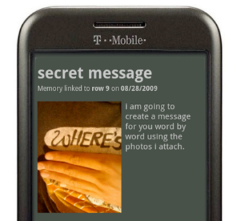
Figure 6. Jane's "secret message"

Penny (recipient): Rather than viewing the gift as a single object, I felt as if I was given the present of captured time.