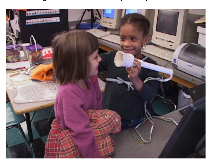
Figure 4. The children trying out different shades of colors and patterns they can find.

The children also looked for colors in unusual places such as the underside of a table and behind the closet, using the brush as a tool to gain access to colors they usually do not see.