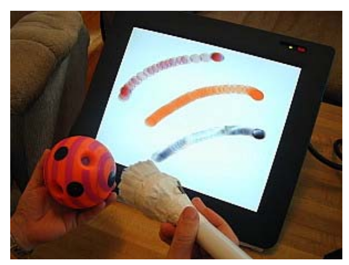
Figure 1. "Picking up" different attributes of an object with the I/O Brush.

Colortron [5] is a handheld device for fashion designers that can pick up any color in the physical world and return the numeric value of the color so that the designer can have the precise color number to work with in their design software. Colortron is accurate in computing the colors, but it is not designed as a tool to draw with, so that the designers must work with separate tools for drawing/sketching their designs. Sharaku by Fuji Xerox is a scanner and an ink-ribbon printer in one handheld device. It was not designed as a drawing tool, so people simply used it to "transfer" texts and images, and not to draw with.