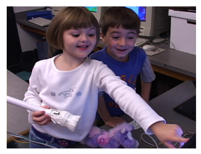
Figure 5. "Look it! This came from my shoe! This line right here, is this line of my shoe!"

They also explored and talked about elements of design while they were looking for items in the classroom. Since the children spent so much time outside of the I/O Brush work area looking for their materials, the researcher decided to also follow the children around. One child was looking through a pile of stuffed animals in the "doll corner." As she picked up a white stuffed bunny, she said, "This bunny is no good 'cause I've already done white!" She then found and grabbed a purple teddy bear and added it to her drawing.