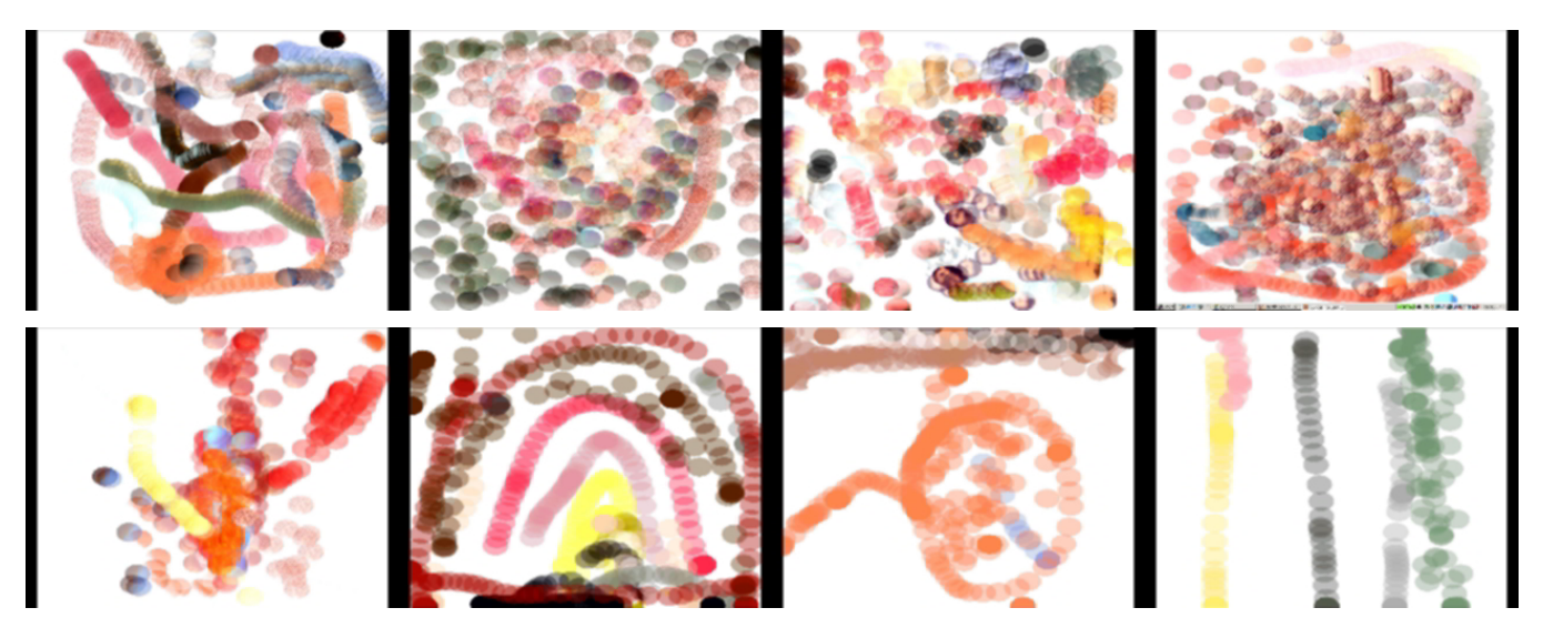
Figure 6: Children's works of art. Top row: typical doodling work by the children. Bottom row (from left): "A Bunny," "Rainbow," "Balloon," "Rainbow"

Allowing finer physical control over the brush, such as pressure and tilt sensitivity, may open up further possibilities for the use by visual artists. In order to assess the impact of I/O Brush with a larger user base, it would be interesting to ask questions such as how I/O Brush changes the notion or style of drawing, and how it changes the way we use drawing tools.