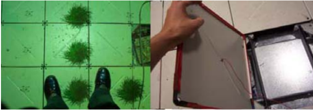
Figure 4. Sociable Floor

We use a modular tile floor with capacitive sensors under the 12"x12" raised modules. Ceiling-mounted projectors paint the floor with information gathered from where and when people stand on the various tiles (Fig. 4).