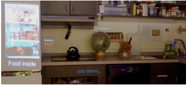
Figure 2. Information Annotation of the Kitchen

moved to the center of the room, it acts as a dining table. The projection shifts to the ceiling-mounted projector, and a concentric game or menu is displayed on the table.