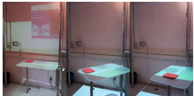
Figure 1. Information Table

its users. Various input devices coupled with the projectors inform the projected content. Gesture sensing and interaction-free displays provide information where and when it is needed while requiring minimal interference[3].