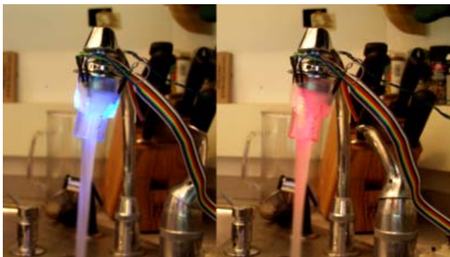
Figure 3. HeatSink

We project textual annotations on the entire working environment, as shown in Figure 2. The refrigerator is “painted” with text and images to describe its contents and the items that need to be purchased, in addition to serving as a digital bulletin board. The dishwasher displays whether it is clean or dirty, empty or full. The electric range informs users on the temperature of its burners. A single multimedia projector can position the information directly on all of these appliances, where users will be certain to notice it. The same system used to annotate the kitchen can be used to decorate the space. Games and other interaction can be projected on work surfaces when the work is finished, while decorative textures can be mapped to change the mood and function of the space depending on its function.