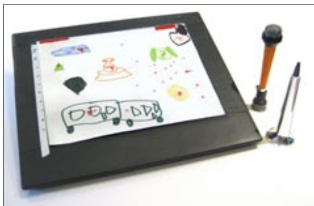
Figure 1. Children use Jabberstamp to create drawings with embedded audio recordings. Children use a special rubber stamp+microphone to record sound and a trumpet for playback. Paper and traditional art materials are used to create drawings.

Permission to make digital or hard copies of all or part of this work for personal or classroom use is granted without fee provided that copies are not made or distributed for profit or commercial advantage and that copies bear this notice and the full citation on the first page. To copy otherwise, or republish, to post on servers or to redistribute to lists, requires prior specific permission and/or a fee.