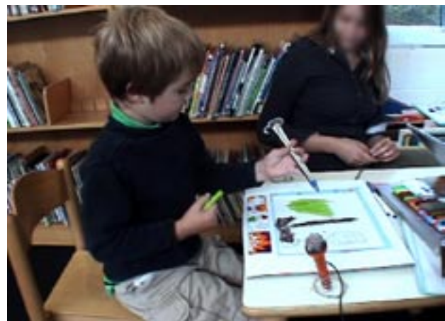
Figure 3. Individual kindergartners used Jabberstamp in their school library.

As a first user test, Jabberstamp was introduced to three kindergartners at a local Montessori school as part of their free play morning exercises [11]. Several children individually worked with the system to explore drawing and recording. All children successfully recorded and played back sounds, although one child did not incorporate sound in her compositions. Our observations of usage and technical problems informed our design of a user study that focused on children's free play with a robust and reliable system.