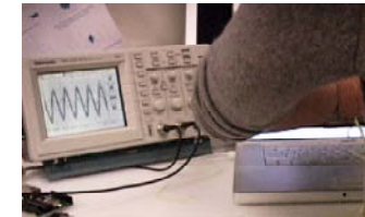
figure 2b: The bracelet is located at 1 inch away from the display.

In the second test, we embedded all electronics within the bracelet itself, exclusively using floating battery power, grounding only to the body, and only displaying a progressively illuminated LED to give us feedback on the level of signals in our passband. The circuit is still quite responsive - the LED progressively turns on starting at 12 inches from the LCD screen, achieving full brightness at a 1-inch proximity (see Figure 3).