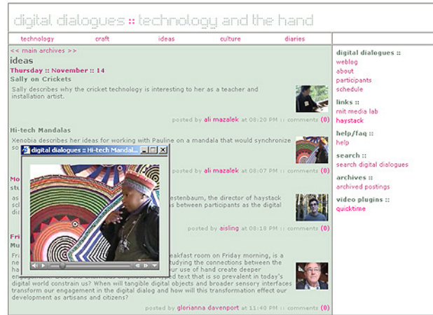
Fig. 1. Screen grab of the Digital Dialogues Video Weblog

Tangible Viewpoints. This physical platform supports interactive story navigation through the manipulation of graspable pawns and other tangible tools on a sensing surface [10]. To date, two different storytelling applications have been written for the interface: a narrative engine for multi-viewpoint character-driven stories, and a navigation system for spatially distributed collective stories. At the Digital Dialogues symposium, we used the latter of these two applications as a tangible/spatial means for the audience to collaboratively navigate through their co-constructed story.