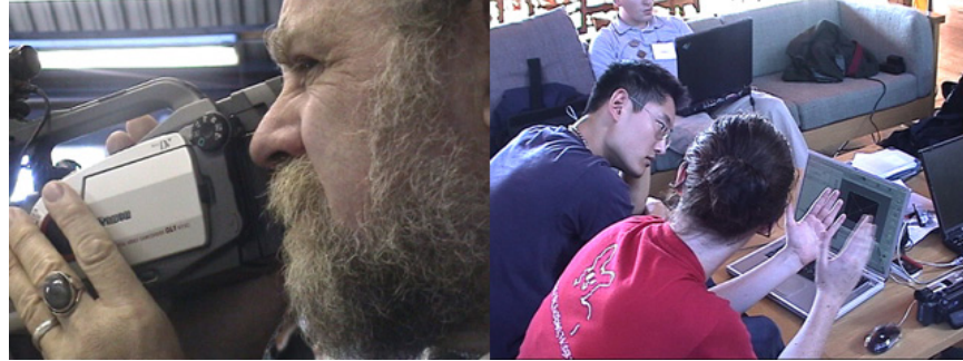
Fig. 3. Participants shooting and editing footage during the Workshop

For the most part the story creation process went smoothly, and we were able to load people's content into the system at reasonably close to real-time. We encouraged participants to use the Tangible Viewpoints interface to collectively engage with their story as it was still being created. The iteration between story creation and story engagement became an act of story revealing, allowing participants to shed preconceived ideas of narrative form in the collaborative construction of stories. After the symposium was over, the Digital Dialogues weblog provided a means for participants to remember and reflect on the event, and to engage in continuing dialogues on the topics addressed during the symposium.