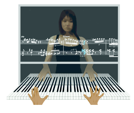
figure 4. Mock-up of MirrorFugue displaying the full upper body of a collaborator and the score

MirrorFugue makes visible the hand gesture of a piano performance, but playing piano also involves movements of the wrists, arms, shoulders, and feet. Even the head movements and facial expression of the pianist contribute to the feeling of the music. In the future, we plan to extend the display in MirrorFugue to show the entire upper body of a pianist.