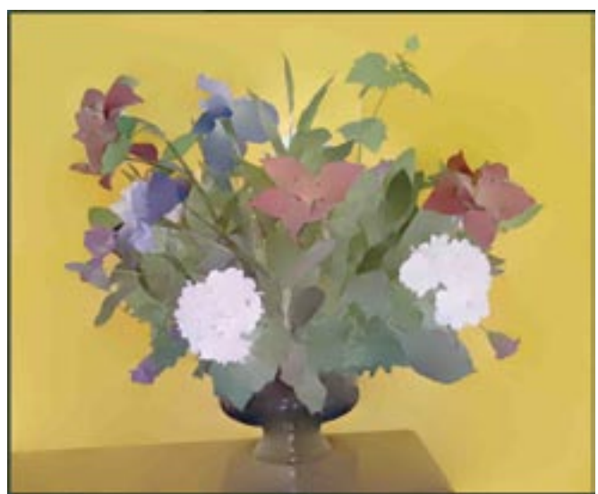
Two floral images are both photographs—given a broad definition of "photograph." The image at left was made with a conventional digital camera; at right, a modified camera recorded the same vase of flowers but then applied edge-recognition algorithms to extract the three-dimensional structure of the scene; the camera then rendered the image in a more painterly style. This method of "non-photorealistic photography" was devised by Ramesh Raskar of the Mitsubishi Electric Research Laboratory and several colleagues.

display pixels. With a million emitters and a million receivers, there are 10^{12} interactions. What kind of image does the sensor produce? The answer is: A total blur. The sensor captures a vast amount of information about the energy radiated by the display, but that information is smeared across the entire array and cannot readily be recovered.