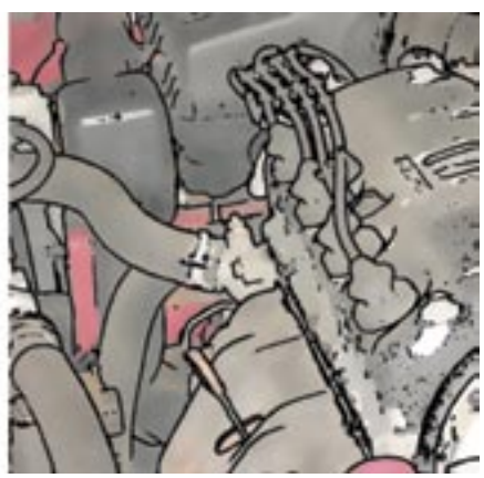
A diagrammatic style of rendering ( right ) can make it easier to distinguish parts against a busy background than a more conventional photograph ( left ). By outlining edges and smoothing or flattening broad areas of color, the non-photorealistic camera of Raskar et al. emphasizes three-dimensional geometric structures. (Images courtesy of Raskar.)

Lensch, now of the Max-Planck-Institut für Informatik in Saarbrucken, working with Stephen R. Marschner of Cornell University and Pradeep Sen, Billy Chen, Gaurav Garg, Mark Horowitz and Marc Levoy of Stanford. Here's the setup: A camera is focused on a scene, which is illuminated from another angle by a single light source. Obviously, a photograph made in this configuration shows the scene from the camera's point of view. Remarkably, though, a little computation can also produce an image of the scene as it would appear if the camera and the light source swapped places. In other words, the camera creates a photograph that seems to be taken from a place where there is no camera.