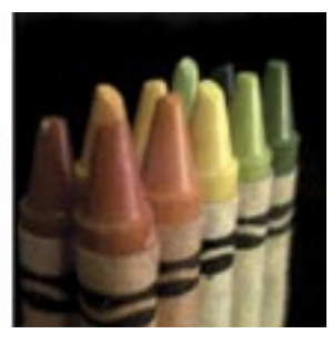
Shifts in point of view are another option in images made with Ng's light-field camera. All three images come from a single exposure, but the camera seems to move laterally, and in the rightmost panel is brought closer to the subject.