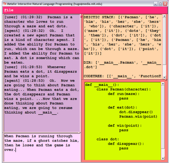
Figure 1. A screenshot of Metafor. Clockwise from the lower left corner, the four windows display 1) the narrative being entered; 2) an interaction log; 3) Metafor's internal representation (not shown to beginning users); and 4) the visualization code, rendered here in the Python programming language.

To illustrate the principles of Programmatic Semantics, we implemented Metafor, a "brainstorming" editor for programs, analogous to an outlining tool for prose writing. As a person types a story into Metafor, the system continuously updates a side-by-side "visualization" of the person's narrative as scaffolding code (see Figure 1). This code may not be directly executable, but it illustrates the