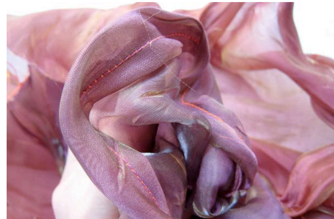
figure 1. This wired apparel alerts the user by mechanically shrinking the fabric onto specific points of tensions on the body.

remember two different shapes at low and high temperature ideally by training. However the shape modification and the return to the original state are difficult to control. For the purpose of Touch·Sensitive , the user needs more tightening and pressure effect onto areas of the body and the change of shape of the wire is not enough. We will couple the smart alloy to a pressure mechanism, this to create areas of tensions. We are aware of the lack of control of the smart alloy and we plan on using its properties to unexpectedly change the fabric structure. The random effect of the textural and dynamic structural parts of the apparel is an element we consider in designing Touch·Sensitive ; and would like to user test it. Designing a computational object means designing for people and it demands reflecting on the object's critical and aesthetic roles [12].