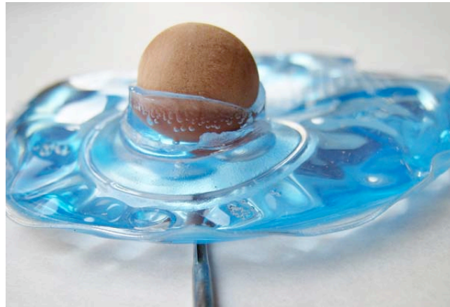
figure 4. Vinyl pockets are filled in with liquid, which diffuses around the massaging wooden ball through thermoelectric sensors.

Since the apparel has a contact with the skin we do consider the following points: