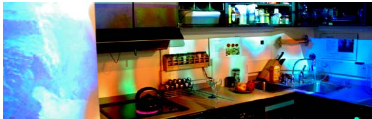
Fig. 1. Cooking with the Elements: Multimedia projections enrich a conventional kitchen by projecting intuitive displays to reveal the status of tools and surfaces.

Abstract. The glut of information produced by ubiquitous computing in augmented reality environments requires that the resulting information displays be tailored to the attention of users and mapped directly to the objects and surfaces of the space. This paper proposes a method for designing and implementing ambient information displays combining ambient displays and augmented reality to produce useful intuitive interfaces that are concretely mapped to architectural spaces for the purposes of expanding and enriching the quality and sensuality of user experience.